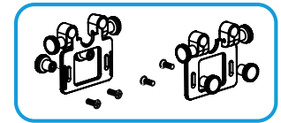
Rod Accessory kit