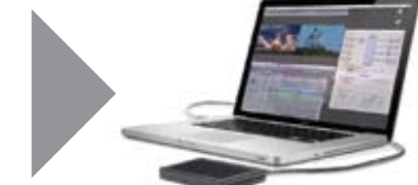
Connect this media to either your Apple MacBook Pro or Apple Mac Pro. Import the footage into Final Cut Pro. Edit. Simple.