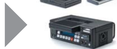
Remove the Storage Module or ExpressCard 34 media from Ki Pro.