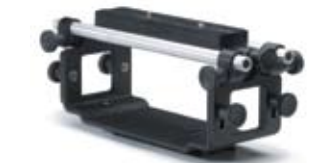
Rod Accessory kit installed on Exo-skeleton