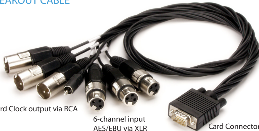
6-channel output AES/EBU via XLR