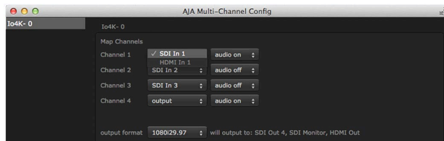
Figure 2. Input Selection Menus

Individual audio on/off selections are available for each channel.