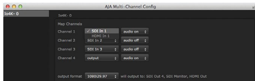
Figure 2. Input Selection Menus

Individual audio on/off selections are available for each channel.