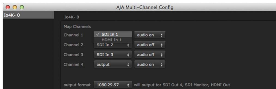
Figure 2. Input Selection Menus

Audio Enable: Individual audio on/off selections are available for each channel.